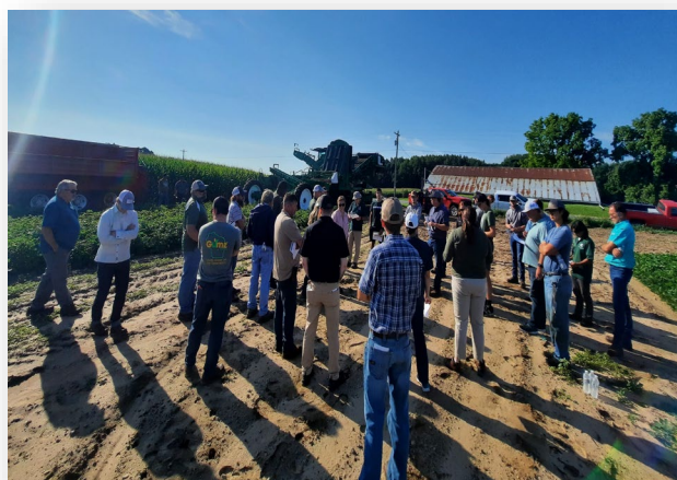
Potato Field Day