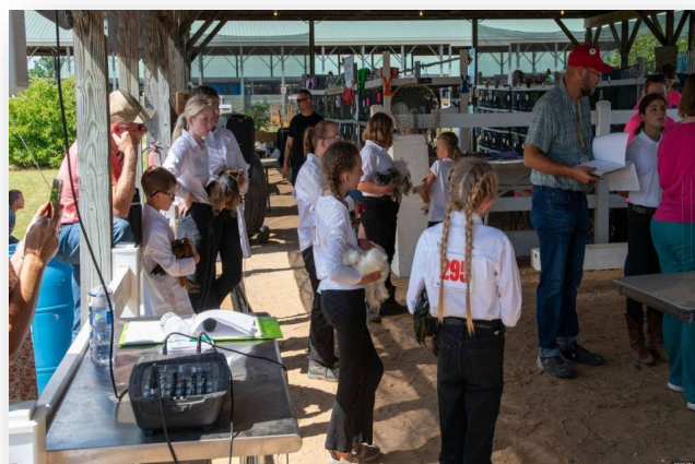
Montcalm County Fair