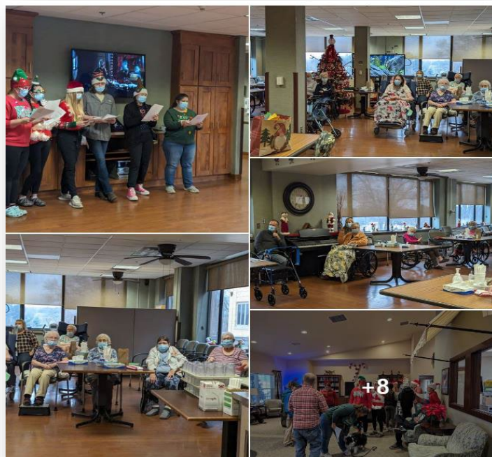
Youth Sing at Nursing Home